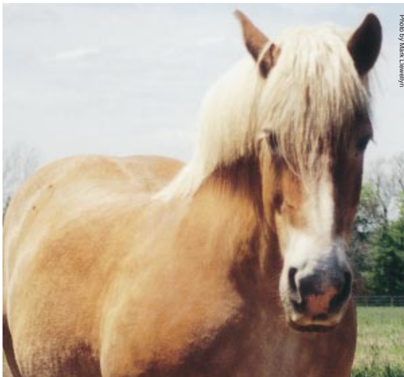
Draft horses were among the first to be diagnosed with Monday morning sickness or tying-up.

Sporadic tying-up should be considered a veterinary emergency if horses are sweating profusely, reluctant to move or have dark urine. Veterinarians may administer medicine to relieve anxiety and muscle pain. In addition, corrections in hydration are made to account for fluid losses and myoglobinuria that may impair kidney function. Further treatment strategies include stall rest followed by hand walking and turnout once initial muscle stiffness has resolved. Grain intake is drastically